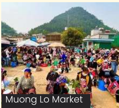
Muong Lo Market