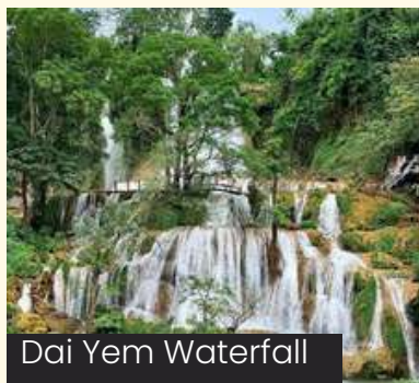
Dai Yem Waterfall