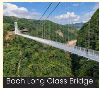
Bach Long Glass Bridge

This morning you will be transferred to Moc Chau , stop enroute at Nghia Lo to visit is the Muong Lo Market in the centre of the town. Almost everything is on sale, such as household goods, ready-made clothes and luxury kitchenware. The most interesting item of the market, which either does not exist or is rarely seen in markets in the lowland region, are booths where husbandry tools are piled up. Moc Chau is reputed for its hill-tribes such as White & Black Thai People and Muong People. Famous for its green tea hills and Moc Chau milk , and wonderful natural landscape, and Dai Yem waterfalls, Hill Pine, and Orchid flower gardens .